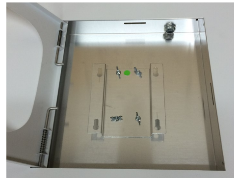
Integrated Mounting Plate, Cord Grip and Repositionable Door